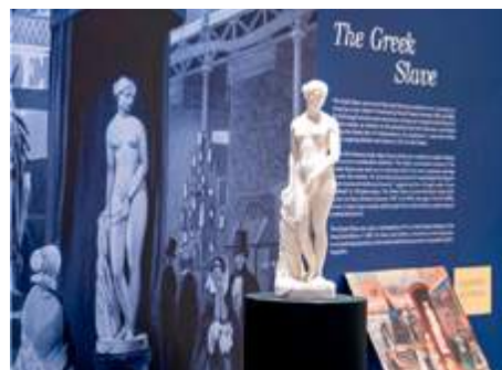
The Greek Slave , completed March 1844, is a renowned marble sculpture by American sculptor Hiram Powers and is one of the best known and critically acclaimed American artworks of the 19th century. Seen here, a much-reduced copy (just 35.5 cm) in Parian porcelain produced by English potters Minton and Company in 1848.