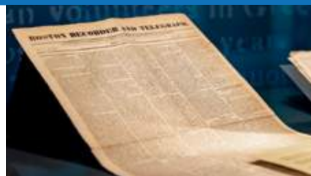
American newspapers were quick to publish news of the Greek War of Independence, as seen in this copy of the Boston Recorder and Telegraph newspaper [Vol. XI, no. 25.], dated Friday, June 23, 1826, proclaiming that "Missolonghi Fallen!" Part of the Curtis Runnels Collection.