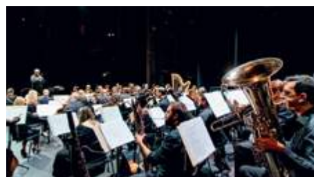
Marco Bozzari , a Greek national opera in four acts, is an ode to the bravery and excellence of the great general of the Greek Revolution. Composed by renowned Greek composer Pavlos Carrer, the play premiered in Patras in 1861 and was received enthusiastically both in Greece and abroad; yet despite the opera's considerable success, the original score has been lost. In 2021, the opera was performed, in Greek, by the City of Athens Symphony Orchestra and Choir, produced by the Culture, Sports and Youth Organization of the City of Athens.