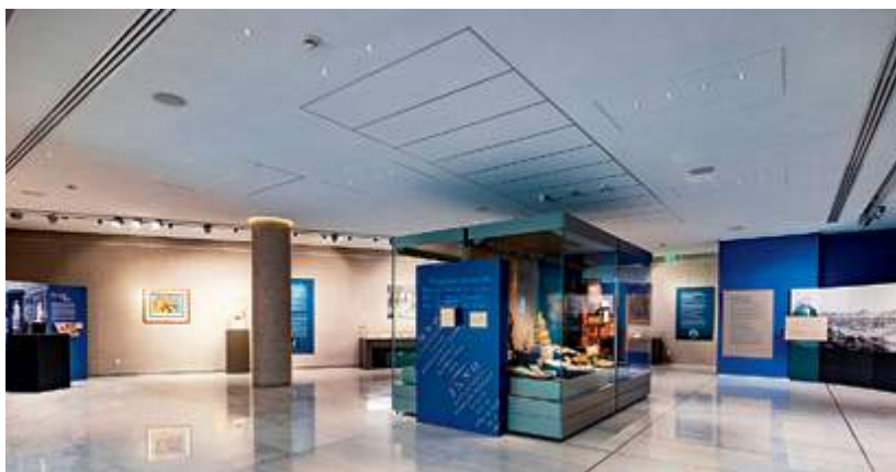
A view of the ASCSA's "The Free and the Brave" exhibition in I. Makriyannis Wing of the Gennadius Library, showcasing a selection of the library's rare archival material on the Greek Revolution of 1821 alongside paintings and objects from museums and private collections in Greece.

an exhibition at the American School of Classical Studies at Athens exploring the relations and connections between Greece and the United States during the century of revolutions